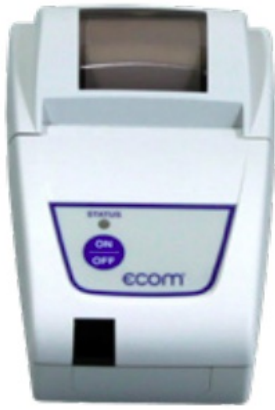
ecom-LSG for leak detection of flammable gases