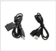
USB 3' Extension Cables "Phone" & "Media"