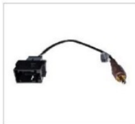
GPS Antenna and extension