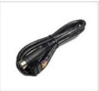
SiriusXM Adapter Cable for SXV300 Tuner only