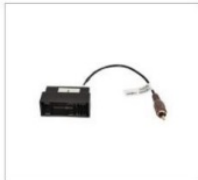
Factory Camera Adapter A and Factory Camera Adapter B (use the one that fits AND works)