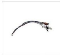
Camera RCA Harness (for factory and aftermarket cameras)