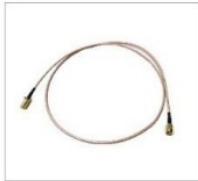
BT/WiFi Antenna Extension