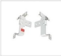
Metal mounting brackets