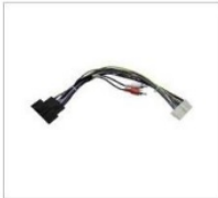
Main Wire Harness