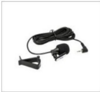
Microphone (for BT calling and voice commands)