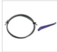
Trim removal tool and fish tape for running cables/wires