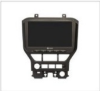
LCD Display Screen