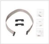
Ribbon cable and hardware to connected screen to unit