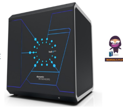
dynamic BIOSENSORS LABELING KIT RED DYE 2 Adapter Stand