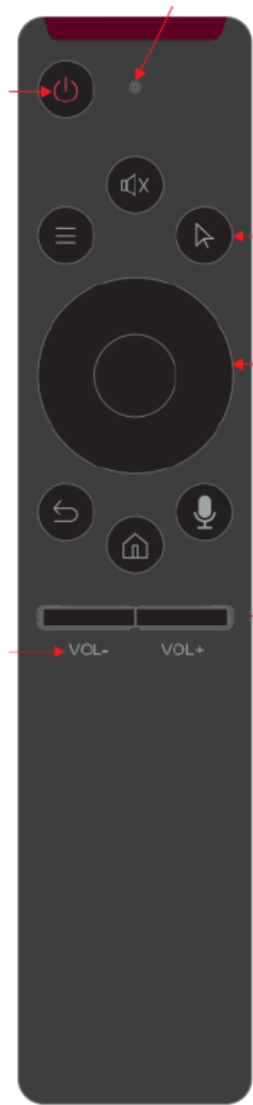
Figure A.1 Remote control appearance