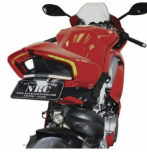
Ducati FE-D18PV4-LP Panigale V2 Fender Eliminator Tail Tidy