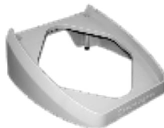
SmartView™ Platform p/n 00-079-009-001