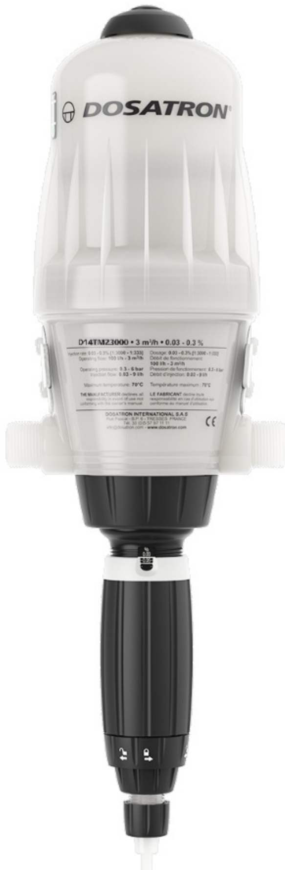
14 GPM: D14TMZ3000