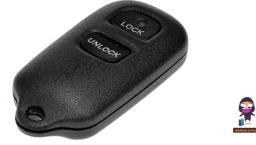
DORMAN 99139 3 Button Keyless Entry Remote