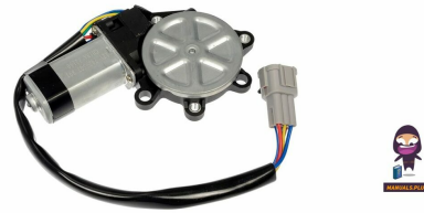
DORMAN 742-507 Front Driver Side Power Window Motor