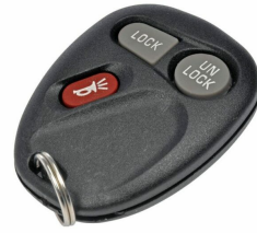
DORMAN 13734 Keyless Entry Remote 3 Button