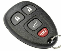
DORMAN 13715 Keyless Entry Remote 4 Button