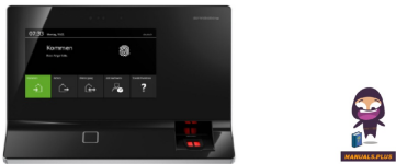
dormakaba Select Multiplexer Language