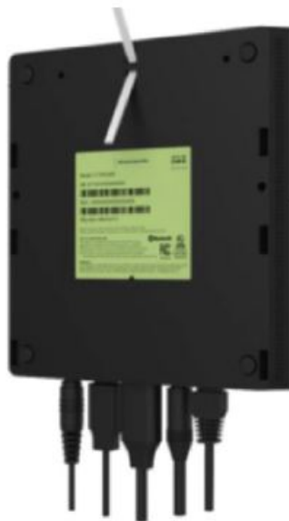
FIGURE 4: DIRECTV STREAM—WALL MOUNTING

The DIRECTV STREAM device (C71KW) works with the RC82V Remote Control. (The box and remote control are not compatible with any older DIRECTV equipment.) Like other DIRECTV remote controls, the RC82V can be programmed to operate some features on TVs or audio/video equipment.