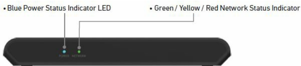
FIGURE 1: DIRECTV STREAM—FRONT PANEL