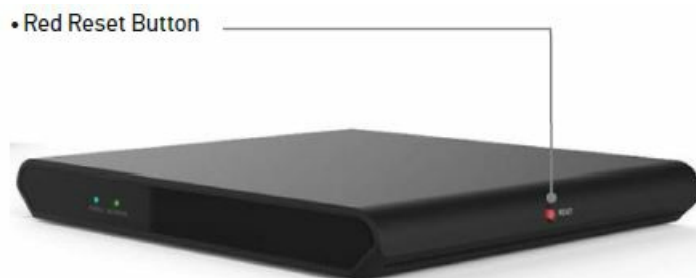
FIGURE 2: DIRECTV STREAM—SIDE PANEL