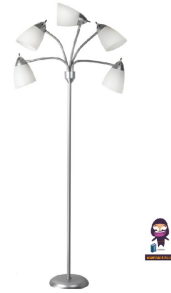
DINGLILIGHTING WS-MNF43-60B-CH Floor Lamp