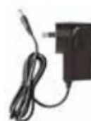
1x Mains Adaptor