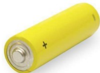
1 AA Lithium Battery