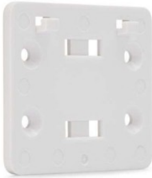
Mounting Bracket & Mounting Hardware