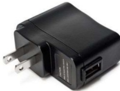
AC Adapter & Power Cable

Note: DicksonWare Secure, which is 21CFR Part 11 compliant, sold separately