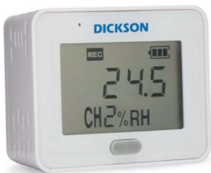
DBL Data Logger