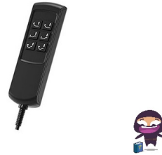
DewertOkin FS2409A Hand Controller