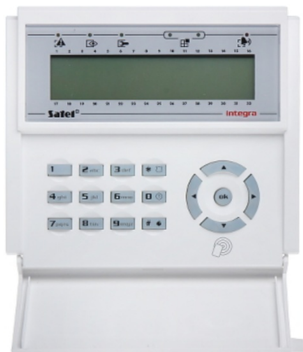
View after open the cover