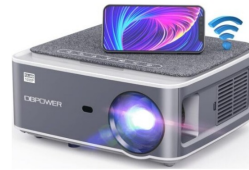
DBPOWER G01 Projector