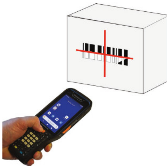
Linear Bar Code