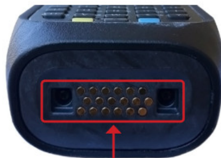
Charging Dock Connector