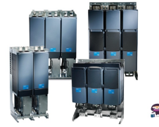
Danfoss VACON NXP Grid Converter