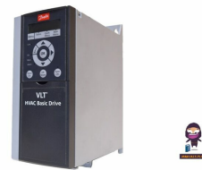
Danfoss H6-H8 Frequency Converter