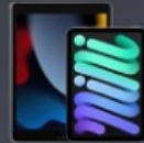
i Pad / i Pad mini 2021