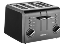
Cuisinart CPT-140 Compact 4-Slice Toaster