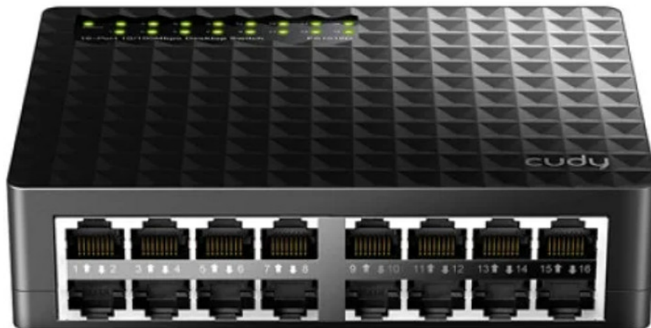
Quick Installation Guide Model: FS1016D