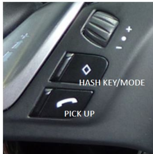
Left side Steering Wheel Buttons

It is necessary to code the ParkAssist of the PCM3.1 system to retrofit the factory PDC.