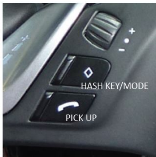
Left side Steering Wheel Buttons

It is necessary to code the rear-view camera input of the PCM3.1 system for use with an aftermarket rear view camera.