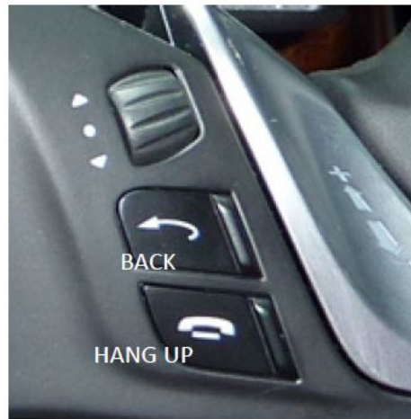
Right side Steering Wheel Buttons