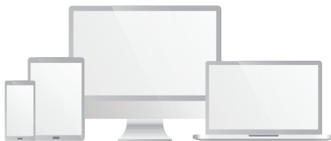
Smartphone, tablet, or computer