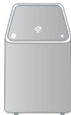
Panoramic Wifi Gateway