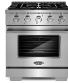
COSMO COS-GRP304 Professional Style Gas Range