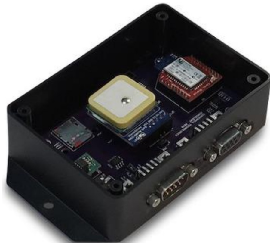
JCOM.CAN.BTS CAN Bus, OBD-II Bluetooth Scanner Device Setup