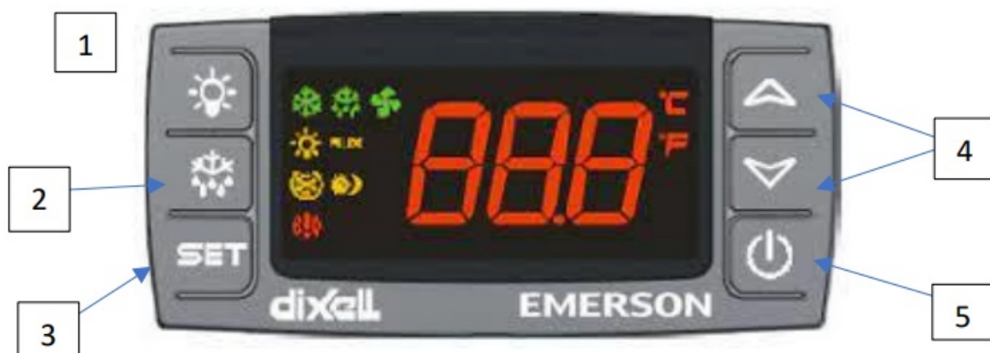
Kuva 5 / Picture 5