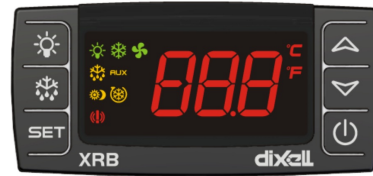
COOL CENTER MC58-UM Electronic Temperature Controller