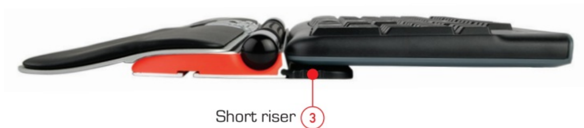
Example 1 - Thick keyboard

Before plugging in the unit take a moment to check the height and angle of your keyboard, and find the arrangement that's most comfortable for you. The package includes keyboard risers (3) (4 ) that can help you to achieve the correct angle and height regardless of the type of keyboard you are using. The spacebar on your keyboard should come just above your Rollerbar. To achieve a proper ergonomic position, the top of the keyboard should be level. The following examples show three different ways of arranging the keyboard. These are typical configurations. Your set-up may vary.