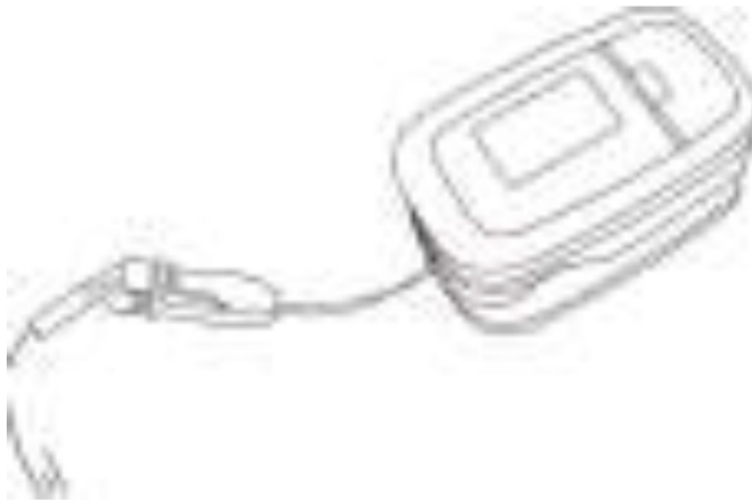
Mounting the Hanging Rope