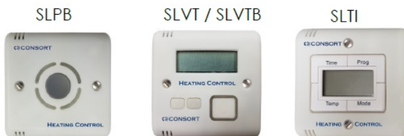
SL wireless controllers

When the Receiver is connected to the mains supply, the LED indicator will light up green, showing that the power is available to the unit. When the output has been enabled by a controller, the LED indicator light will turn red. This product can only be used when connected to any SL wireless controller. Each SL controller can control any number of receivers providing they are in the RF range.