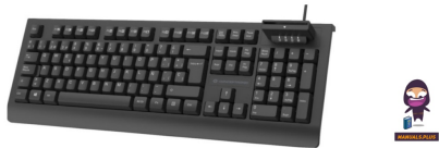
CONCEPTRONIC KAYNE01ES USB Keyboard Smart