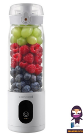
concept SM4000 Smoothie Mixer