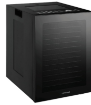
Concept SO5000 Fruit Dehydrator