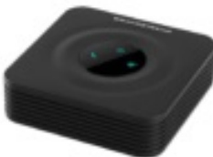
HOME PHONE ADAPTER (GRANDSTREAM HT801)