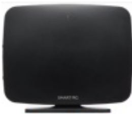
INTERNET MODEM (SR515)