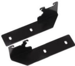
Side Bracket x 2