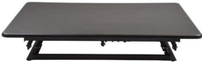
Desk Body x 1