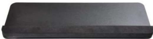
Keyboard Tray x 1