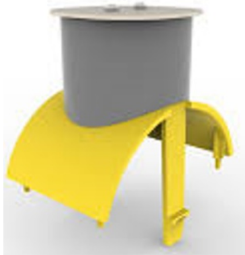
FiberGuide® Express Exit Spool Kit, Yellow