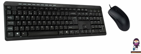
Combrite KM230U Wired Keyboard and Mouse Set