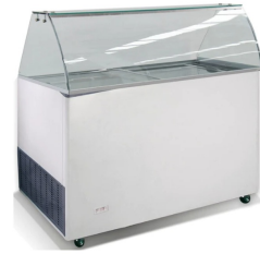
CombiSteel 7472 Series Ice Cream Display