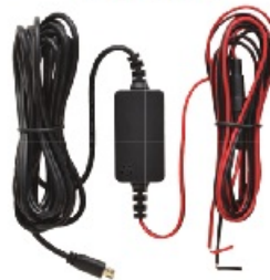
Direct Wire: CA-MICROUSB-003