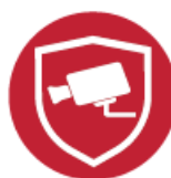
Parking Live View