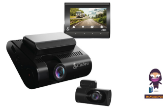
Cobra SC 250R 4K Dual View Front and Rear Dash Cam