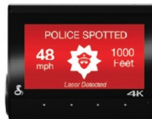
Shared Radar & Laser Alerts