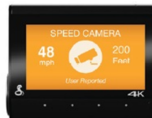
Red Light & Speed Cameras