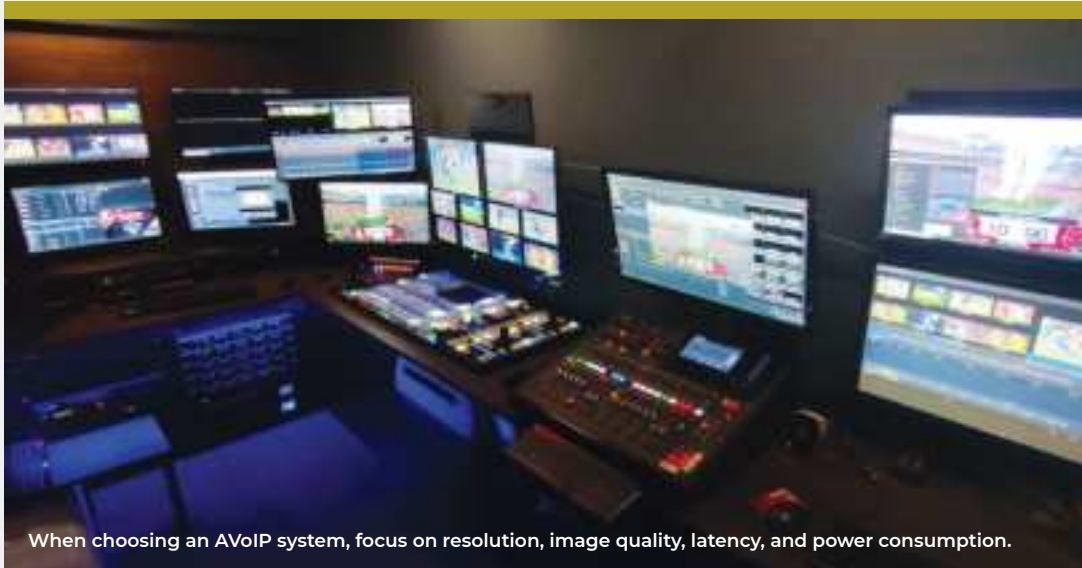
When choosing an AVoIP system, focus on resolution, image quality, latency, and power consumption.