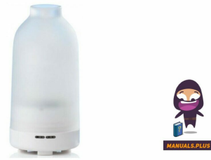
CLI-MATE CLI-AD-LED Ultrasonic Aroma Diffuser