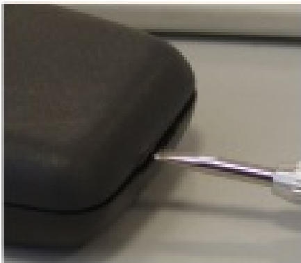
Pic. 2: Opening the Speed Light