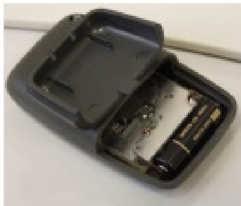
Pic. 3: Polarity of the battery