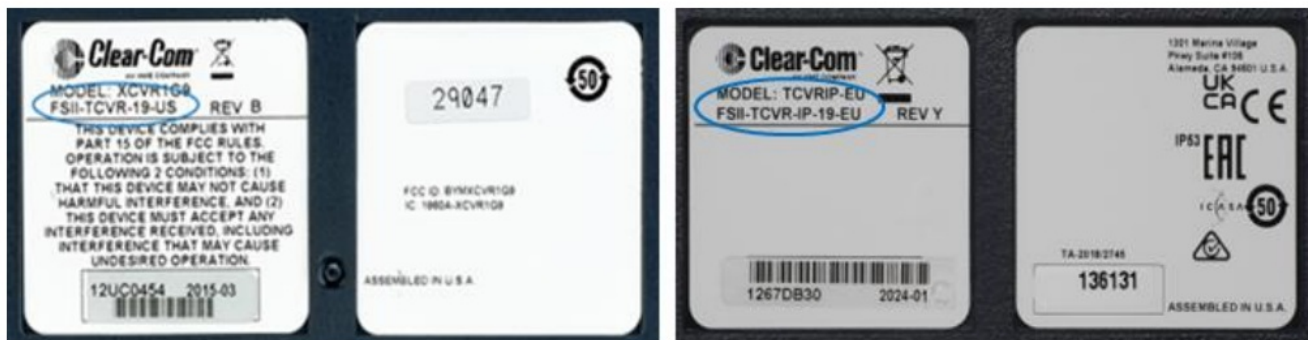
Example of Clearcom product labeling noting the regional frequency setting for use in the U.S. (left) and EU (right)

Manufacturers of DECT-based wireless intercoms must offer products defined and limited to the ETSI standards and restricted to operate on frequencies allocated by country-specific regulatory authorities in the frequency band between 1880 and 1930MHz. Furthermore, in the USA, the Federal Communications Commission stipulates that a manufacturer of DECT products cannot give users, dealers or other third parties the ability to tune their devices such that they would be in violation of FCC regulations for DECT regional settings. Other countries have similar restrictions on the tunability of DECT systems. Manufacturers usually limit the frequency range of DECT intercom systems through factory programming. Due to regulations, only the equipment authorization holder, which is usually the manufacturer, is allowed to change the configuration of the equipment. In the US, the FCC does allow dynamic region selection. Use of such methods typically have other restrictions. For example, if GPS location is used to determine region, the system will require a GPS fix prior to initiating transmission