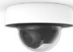
MV SMART CAMERA