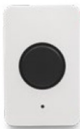
SMART AUTOMATION BUTTON