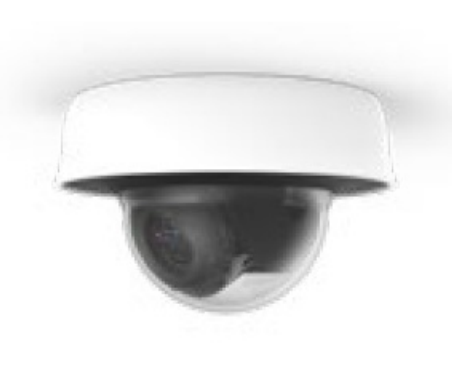
MV SMART CAMERA