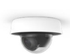
MV SMART CAMERA