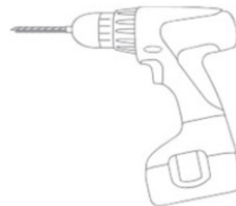
Drill with 1/4" (6.3mm) bits